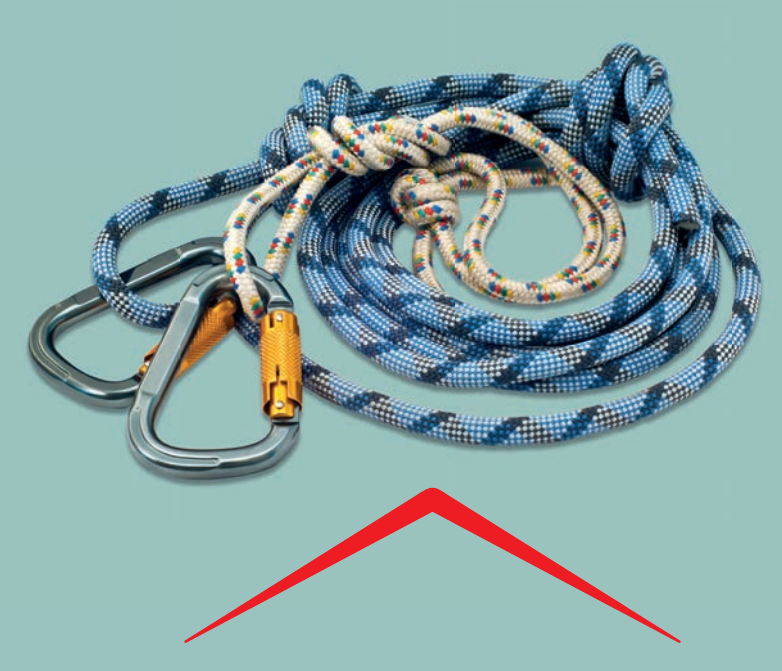
Why early action is the key to avoiding or surviving financial difficulties